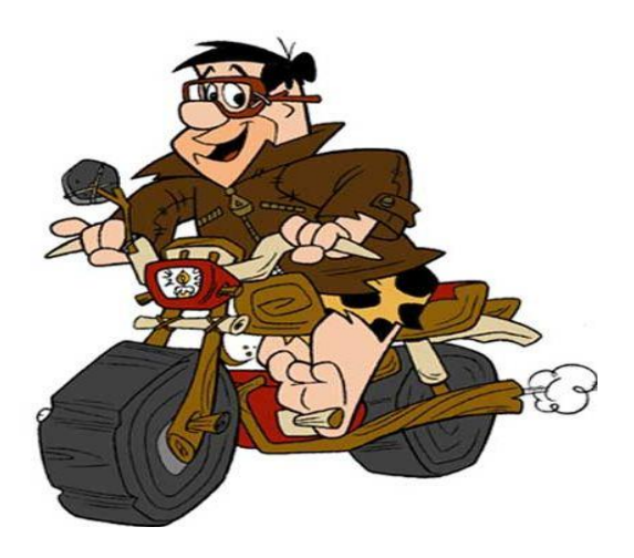
See you on the next ride or at the next meeting. Next Meeting: 7:30 PM – April 1, 2014 NEW LOCATION!

Or the one about the man that passed out. 911 was called and he awoke as the paramedics arrived. The man said he passed out in shock because his teenage son aged to for the keys for the garage, and instead of taking the car out of the garage, his son took the lawn mower out and started to cut the grass.